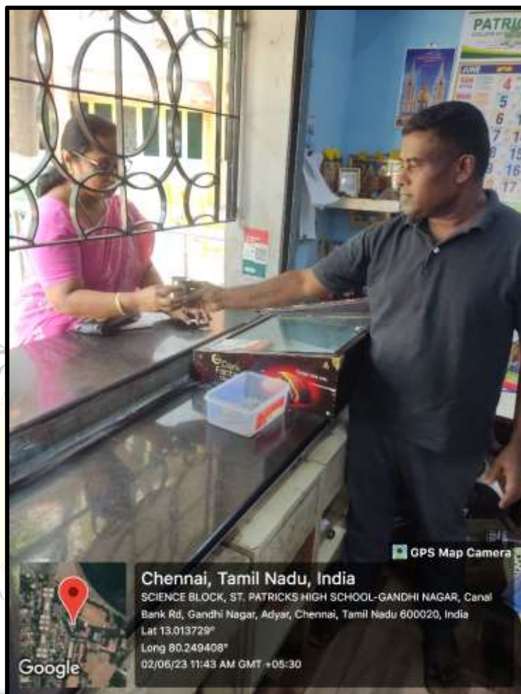
Tea served in steel cups